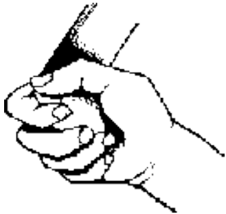
Holding the Boomerang

Each one is carefully prepared using the best Russian Birch wood plus water based, non-toxic stains, paints, and clear coats that ensure durability, aesthetic visual appeal, and functionality.